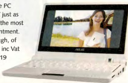
The Eee PC's 7in screen and processor will be adequate for most tasks

It is no substitute for a fully fledged notebook or PC, which is why it did not enthuse some in the office. The 7in screen is too small for comfort and the processor, described as 'Intel mobile', will not