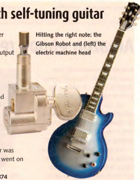
Hitting the right note: the Gibson Robot and (left) the electric machine head