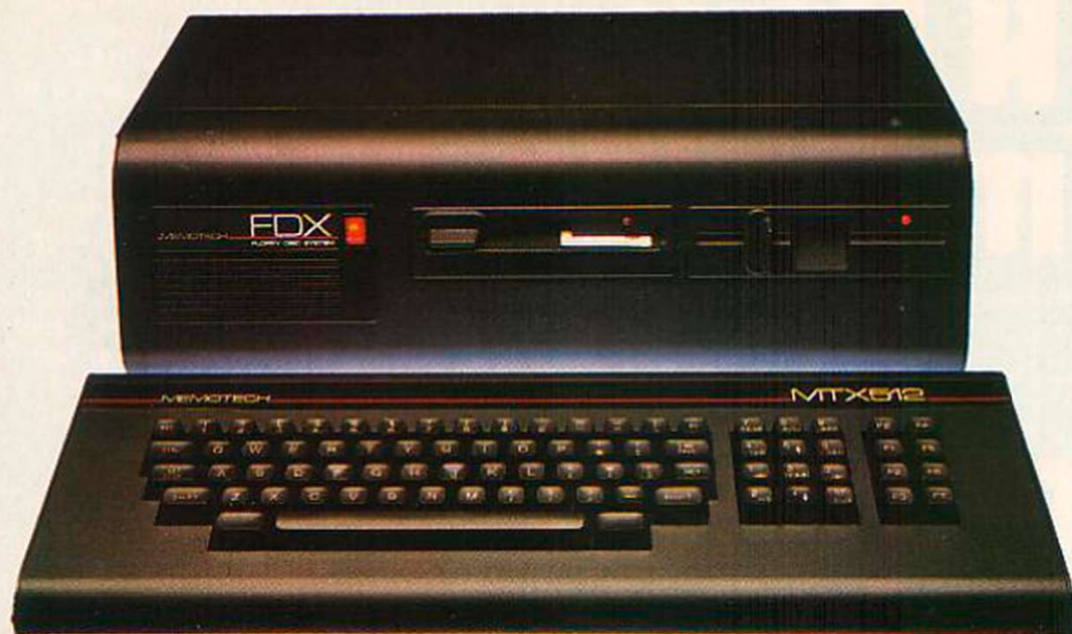
MTX512 plus twin 5 1/4" disc FDX. A CP/M based business system - £1245 inc VAT.