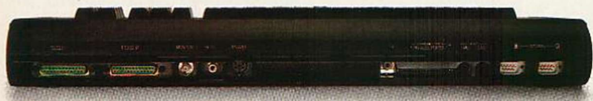
Input/Output Monitor, Hi-Fi, Power, TV, Centronics, Cassette Mic and Ear, and two Joystick ports all come as standard; the twin RS232 ports are available as expansions.

Station Lane Industrial Estate Witney, Oxon, OX8 6BX. Telephone (0993) 2977 Telex: 83372 MemtecG.